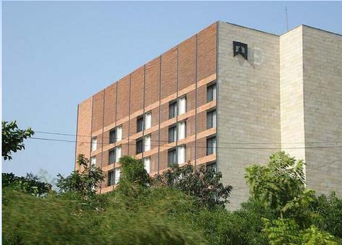
ITC Sonar Kolkata. One of the top 5Star Delux Hotel