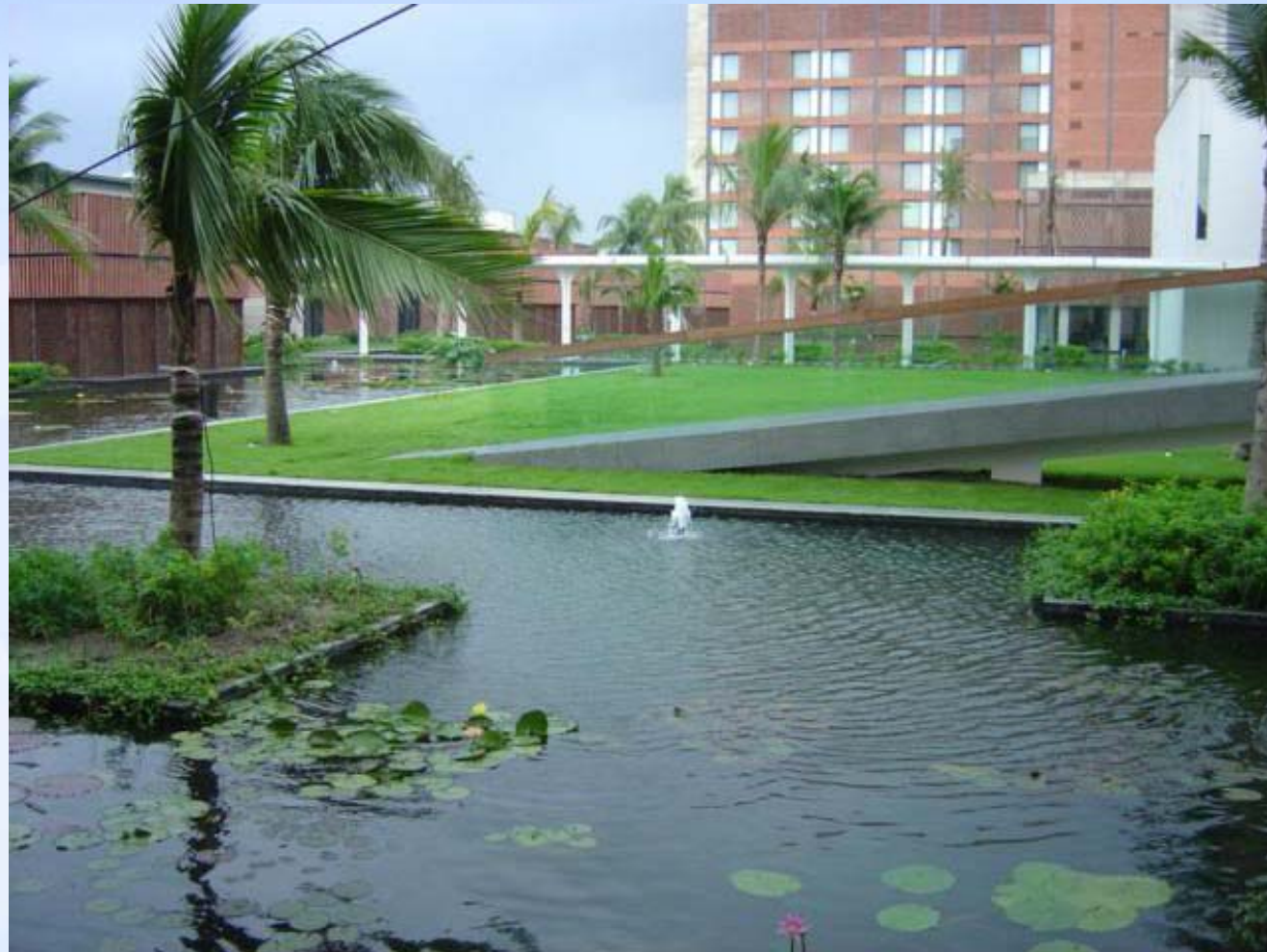
The outside of the venue designed around the water bodies of Bengal