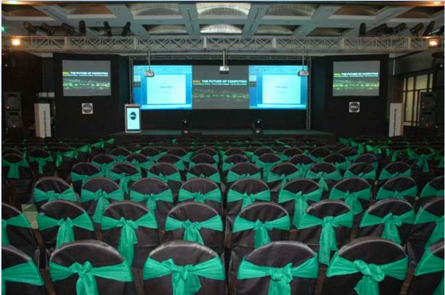
Conference Hall at the venue