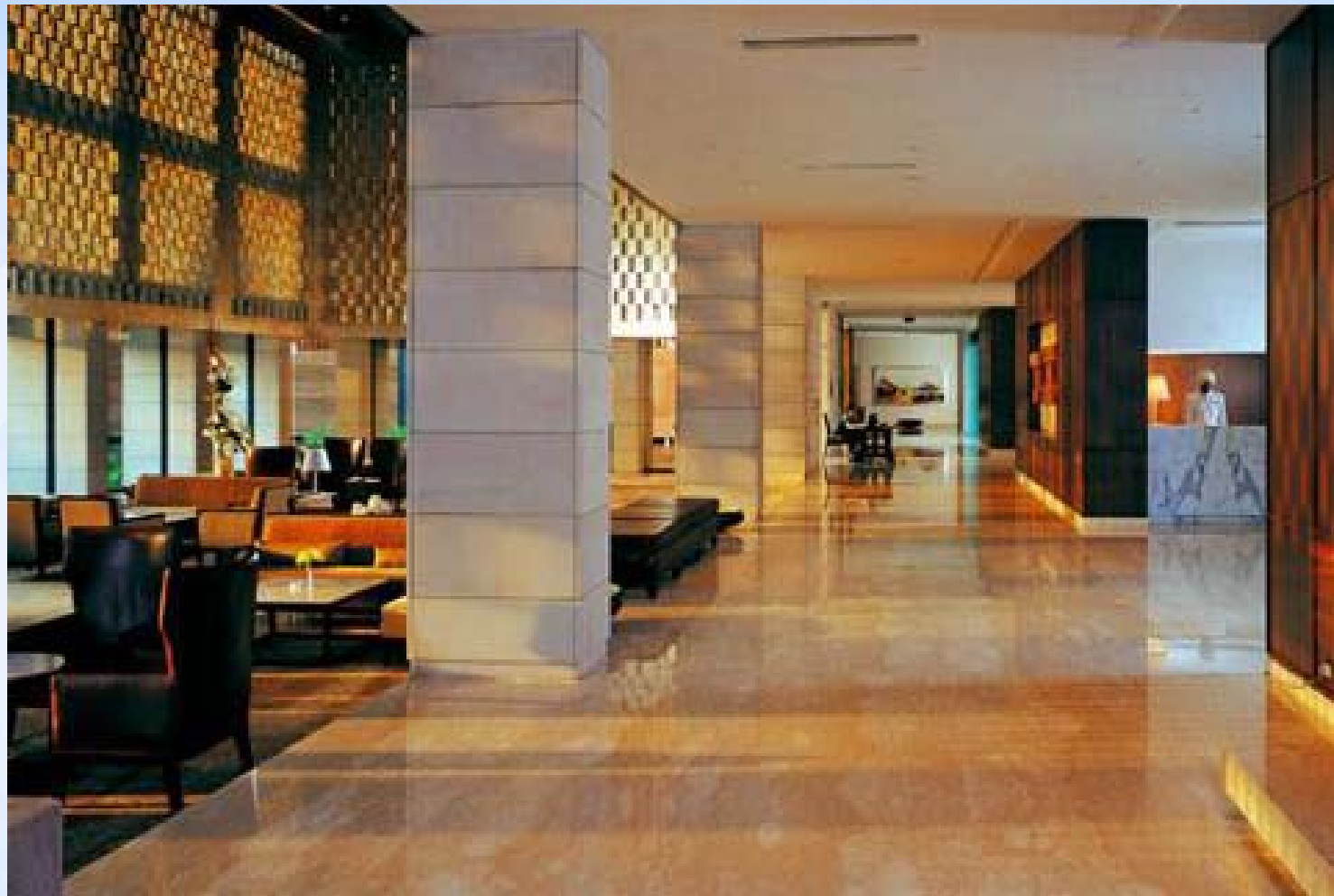
The Lobby of ITC Sonar Kolkata